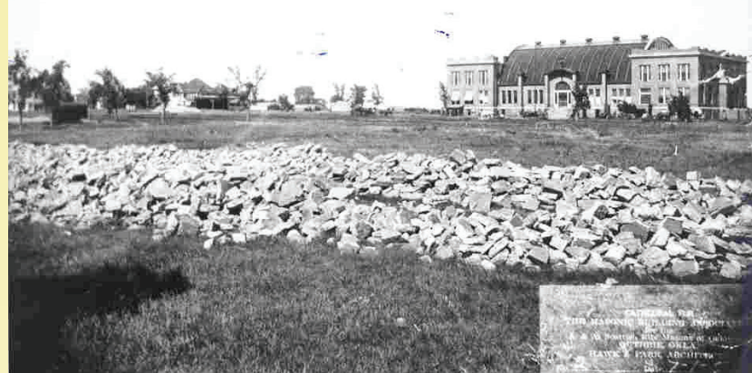
Photograph taken July 1, 1920