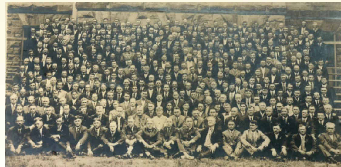
The Cathedral Ground Breaking Class May 3-6, 1920

The ceremonial and symbolic dedication ceremony of May 6, 1920, marked a new era for Scottish Rite Masonry in the Valley of Guthrie. In fact, 1920 was a pivotal year for the Scottish Rite in Oklahoma. About the same time the first shovel of dirt was being turned in Guthrie, the Brethren of Indian Consistory No. 2 at McAlester, without any ceremony, but with no less zeal, broke ground for a half million dollar addition to their temple, which would become one of the finest in the Southern Jurisdiction in its own right. The two Oklahoma Valleys, building well in the beginning, would remain in the top three in overall membership growth for the next three decades.