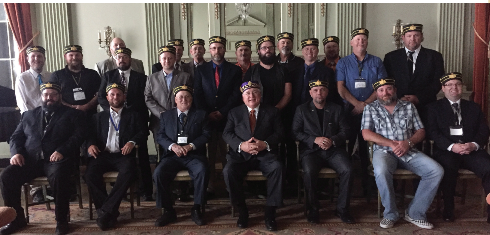
Spring 2017 Class Patent Presentations