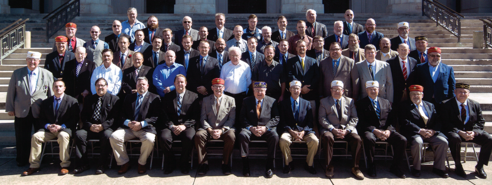
The Living Stones Reunion, October 7-8, 2017